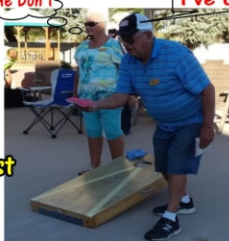
No He Don't