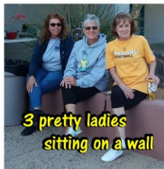
3 pretty ladies sitting on a wall