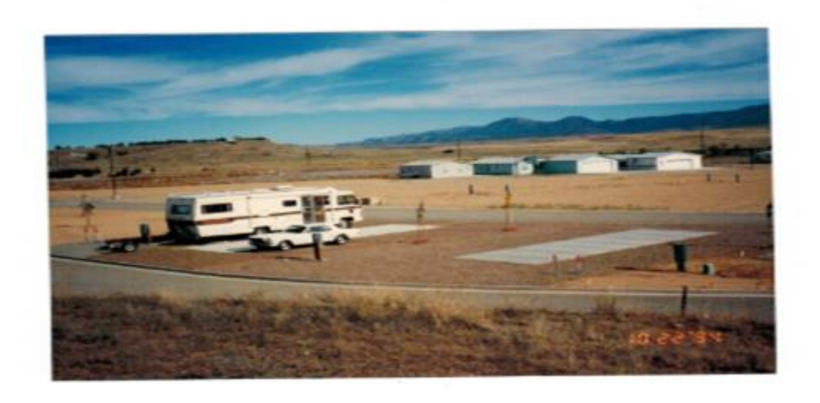
Nicky Leveque's Lot 10